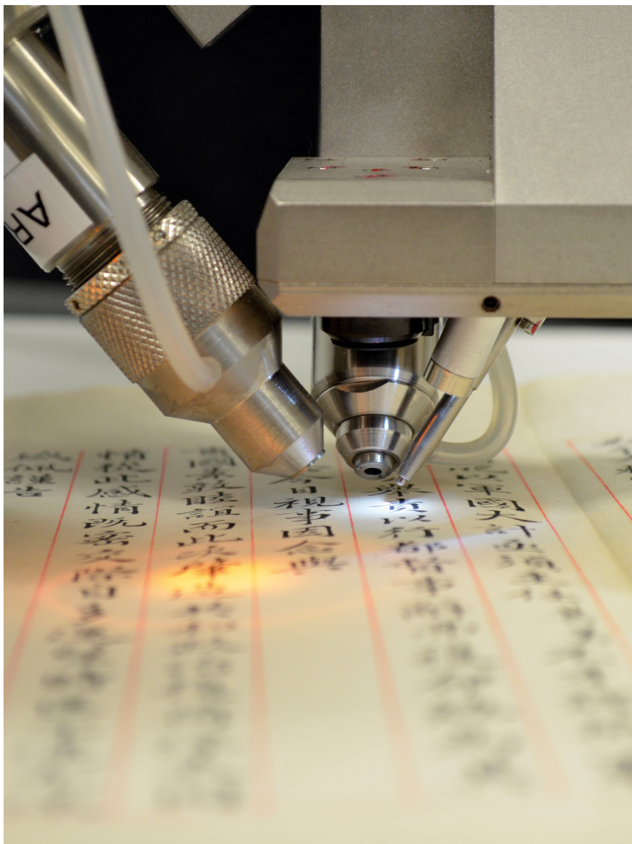
Ink analysis of Chinese manuscript done with ARTax in the CSMC laboratory.