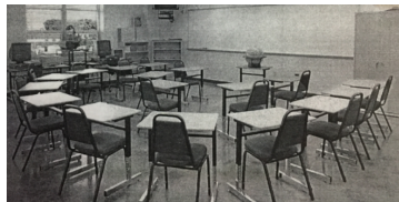
Figure 3: Edward's second image of his preferred learning environment

Images within this domain reflect how learning can be achieved from discussion. Edward provided a second image depicting a semi-circular set up class as shown below: