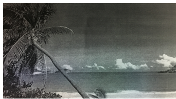
Figure 5: Hubert's preferred learning environment

Images for this domain were the fewest in number as it was only Hubert that chose such a preferred learning environment. The image he provided is the following: