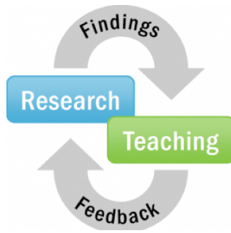
Figure 6: Jane's preferred learning environment

needs and expectations; and assessment preferences. In addition, the second purpose was to investigate students' preferred learning environments.