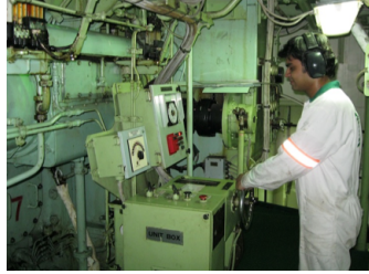
Figure 2: An example of an engine room