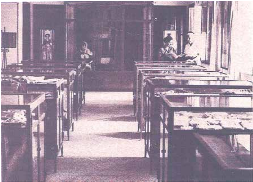
Fig. 1: The Zygomala Museum in 1967 – as Loukia had set it before her death. Magazine Ginaika (Woman) , 467, 1967.

The museum (Fig. 1) indeed remained as it was (although no order for embroideries were ever received) until the 1980s when the Ministry of Culture (which had taken over from the Ministry of Education in 1977) decided to properly conserve and document the collection, pay for reconstructions of the house which in the meantime had been deteriorating, and reorganize the exhibition in a more scientific manner. The new exhibition was inaugurated on July 16th, 1991 and it is still in place today. 8