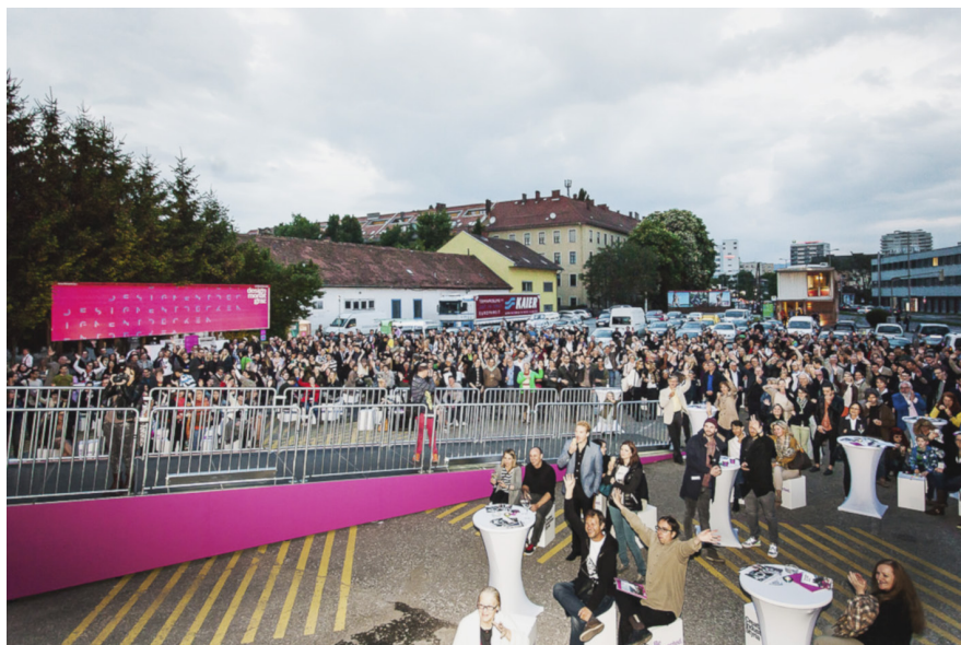
Ill. 4: Opening of Designmonth 2014.

the significance of design as an important economic success factor and thus making this concern clearly visible to everybody (Ill. 4). 14