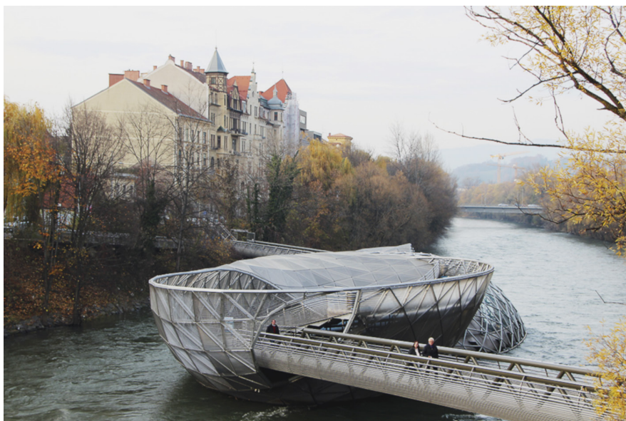
Ill. 2: Murinsel.

the main emphasis was on the motivation of the local scene to participate in their projects. From over 700 submissions, 108 schemes were selected to be realized during the project year. The program was positioned between the poles of high culture and innovative experiment, trying to »awaken the city's and its population's sensitivity towards others, their receptivity for new things and enthusiasm for a vibrant cultural life«. 6 Projects like the ›Mountain of Memories‹, which actually invited people to participate by bringing their personal memories of the history of Graz into an exhibition project, were successful in stimulating a feeling of increased team spirit all over the city for this one year of being Cultural Capital.