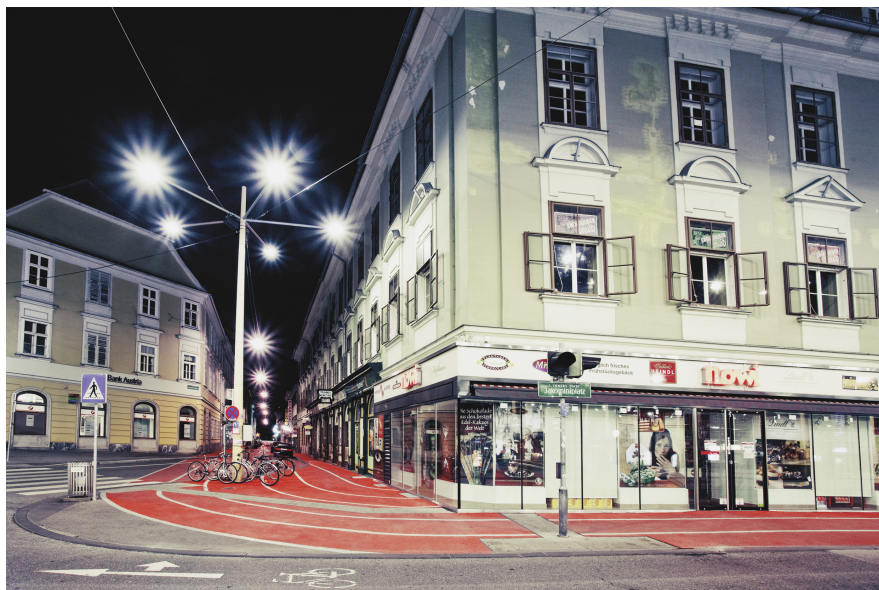
Ill. 5: The Red Running Track.