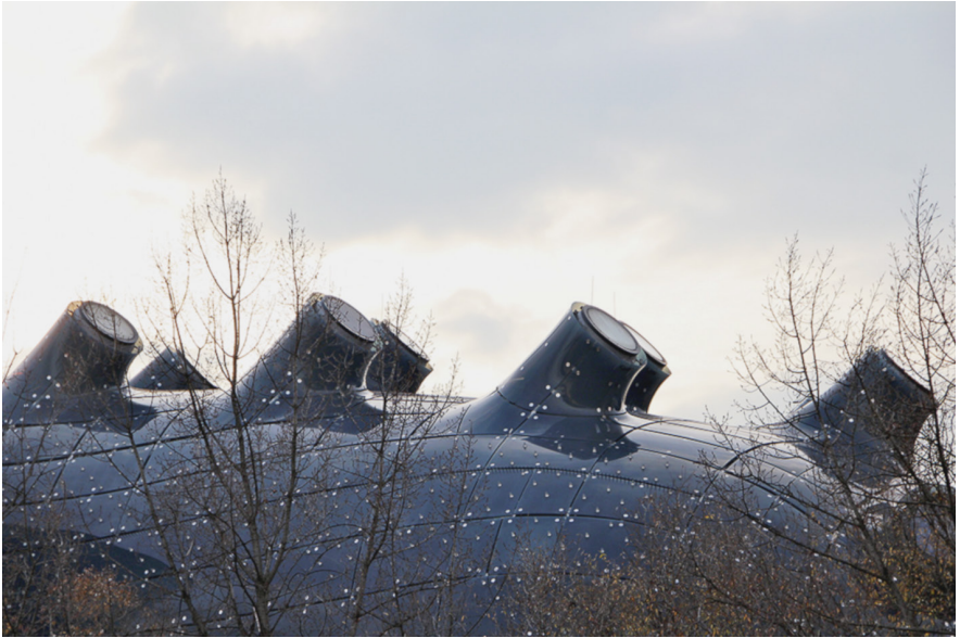
Ill. 1: Kunsthaus Graz .