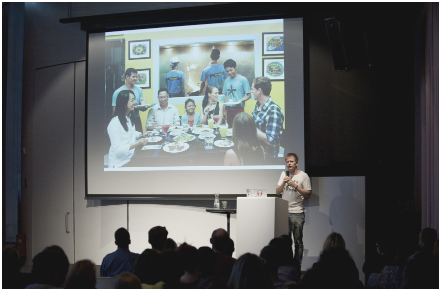
Ill. 7: Since 2010 at the FH Lecture Days international initiatives and designers are presenting their work at the Designmonat Graz. 2015 ›Friends International‹ from Cambodia explained their social entrepreneur business model.

to the companies. Since 2009 more than 1.5 million visitors have seen the companies of ›Experience Economy. 21