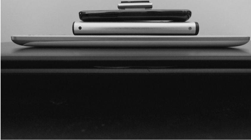
Ill. 2: Media convergence

Die Bewahrung des digital heritage ist eine nicht endende Aufgabe, solange sich der Mensch weiterentwickelt.