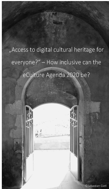
Ill. 1: eCulture Agenda 2020, Photo: Sebastian Gietl, Regensburg

Hamburg, see ill. 1 3 ). Moreover, we observe the emergence of new stakeholders across Europe such as digital repositories for digital long-term preservation (e.g. the Digital Repository of Ireland, see the contribution of Natalie Harrower in this issue), and of data aggregators like Europeana that stack digital copies of cultural materials, which are out of copyright and may be broadly used, for example in thematic collections across the web – to name a few approaches.