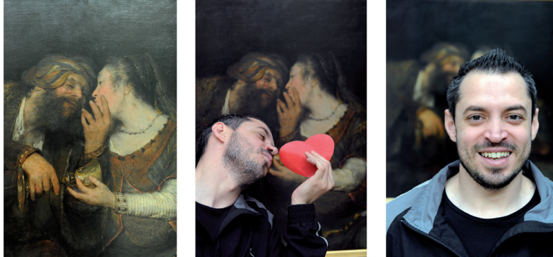
'Loth and his daughters', A. De Gelder