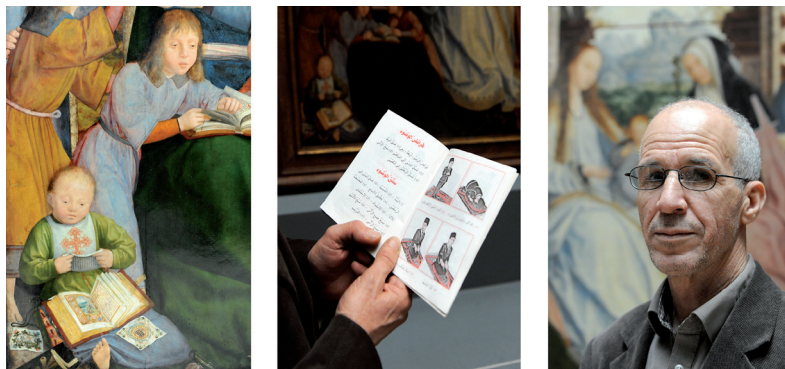
'Triptych of the brotherhood of Saint-Anne', Q. Metsys

"This painting shows us 'an ideal happy family'. I love my family. I miss so much my family that remained in Turkey ... but my son is here and he makes me very happy."