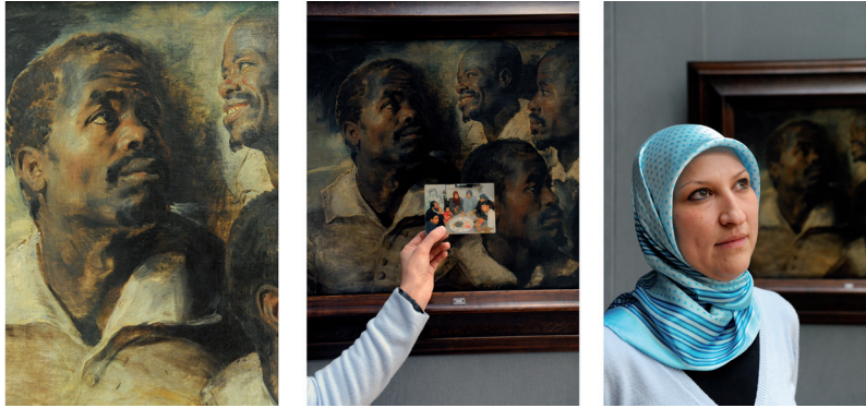
'Studies of the head of a Moor', P. P. Rubens