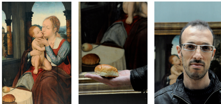
'The Virgin and the Child', Q. Metsys