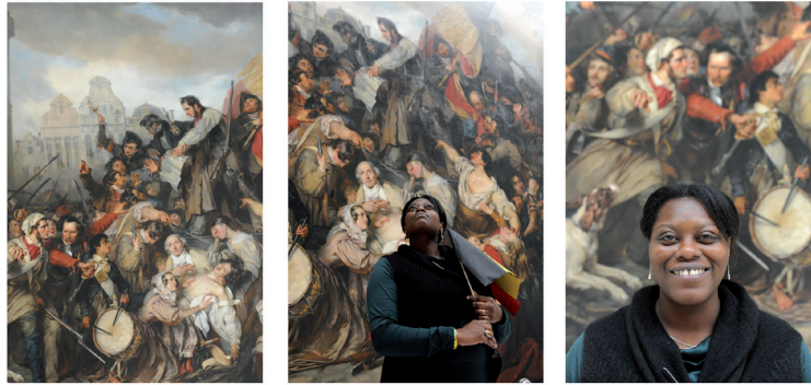
'Episodes from September Days 1830', G. Wappers