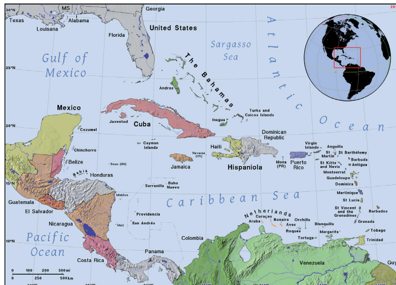
Figure 3: A political map of the Caribbean as it is currently constituted.

Overnight E became an empty sign, pointing to nothing and a new verb was coined. In 2006 the American Dialect Society voted to pluto/to be plutoed is “to demote or devalue someone or something” as its word of the year. 1 That same year the National Air and Space Administration launched the New Horizons mission to the outer regions of the solar system and recently on December 6th, 2014, the sleeping craft awoke to English tenor Russell Watson singing a specially recorded version of “Where My Heart Will Take Me” (BBC) in preparation for its January 2015 rendezvous with the now dwarf planet. This is a truly romantic use of science with aims noble and pure. But one cannot deny the cold war legacy of the “space race” and how even now there is no way to delimit the boundaries between technology made for peaceful ends and that which will be used for war and oppression. In his film Inextinguishable Fire (1969), Harun Faroki concludes his investigation into the manufacture of Napalm by Dow chemicals with the following statement: “What we make depends on the workers, the students and the engineers” (Faroki 1967): In other words, companies manufacture and governments militarize technology what civil society institutions and persons allow them to. In the United States, the aerospace industry has enabled spaceflight but it has also perfected drones that allow for ever more impersonal surveillance and killing.