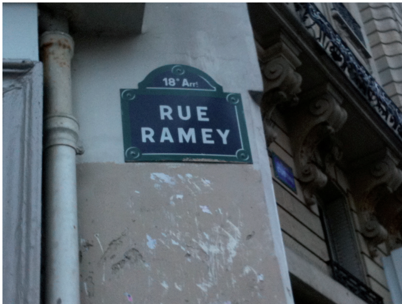
Figure 1: Rue Ramey, Paris France

“Appeals to the past are amongst the commonest of strategies in interpretations of the present. What animates such appeals is not only disagreement about what happened in the past and what the past was, but uncertainty about whether the past really is past, over and concluded, or whether it continues, albeit in different forms.” (Said 1994:3)