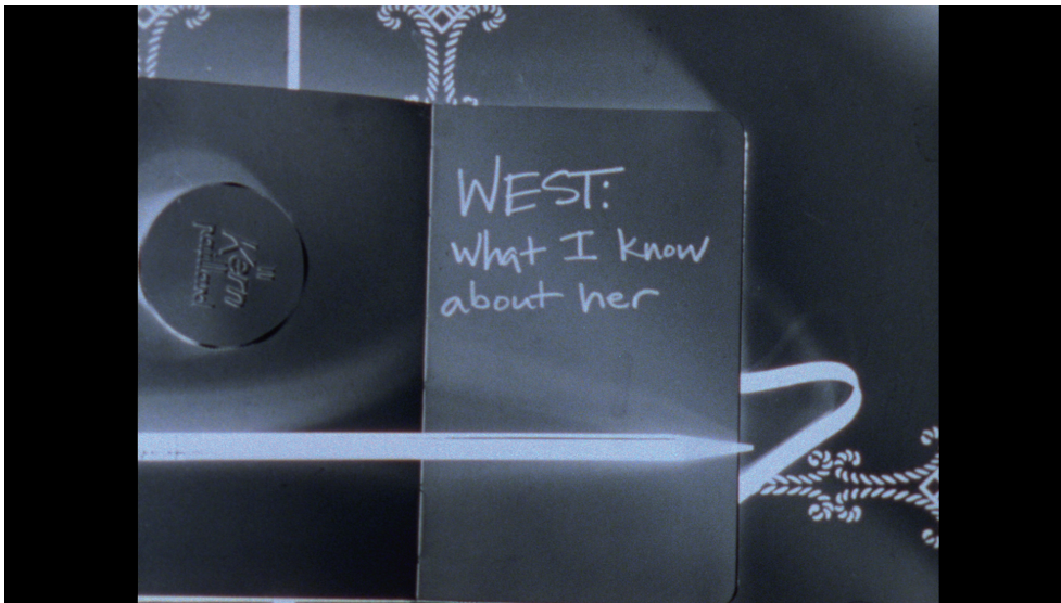
Figure 6: “Journal entry” from WEST: What I know about her

making of meaning. In WEST I relied predominantly on text that I “found” on historical markers as well as “journal entries” about the main character written under the camera. The film also featured strong ambient sounds and sound effects that helped to accent certain scenes. The film is a first person account told without voice over.