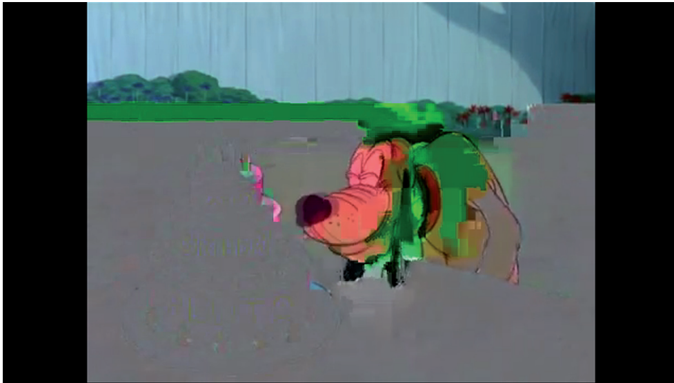
Figure 8: Glitched image of the Disney dog Pluto from the trailer for the film E 3