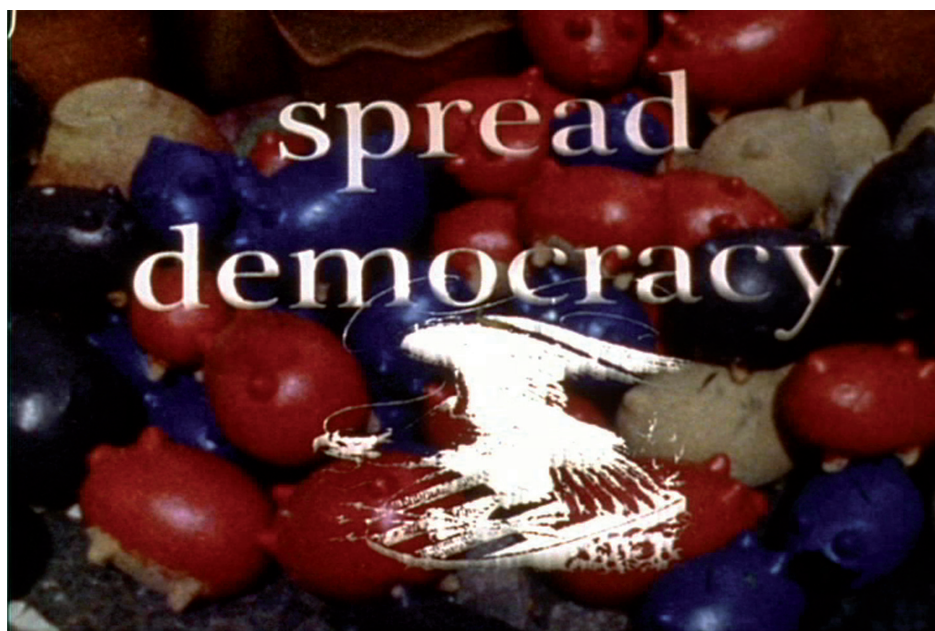
Figure 5: Film Still Yanqui WALKER and the OPTICAL REVOLUTION

qui WALKER and the OPTICAL REVOLUTION had a similar structure in that it connected, a biography of William Walker (American born dictator of Nicaragua in 1857), a sketch of the science of optics from the last three centuries, an overview of the transition from colonialism to neo-colonialism in Central America and a travelogue of my experience traveling through the terrain pertinent to the narrative. The film also employed a reworking of found film materials, mostly educational films about Central America and through the use of these materials raised the questions: How have we been taught to think about this region? Who benefits from us thinking this way? Who suffers? What is hidden? When discussing the rationalizations for invading Nicaragua, William Walker said he was going to “spread democracy” to its inhabitants. This is a claim that the United States continues to use to this day to invade sovereign nations.