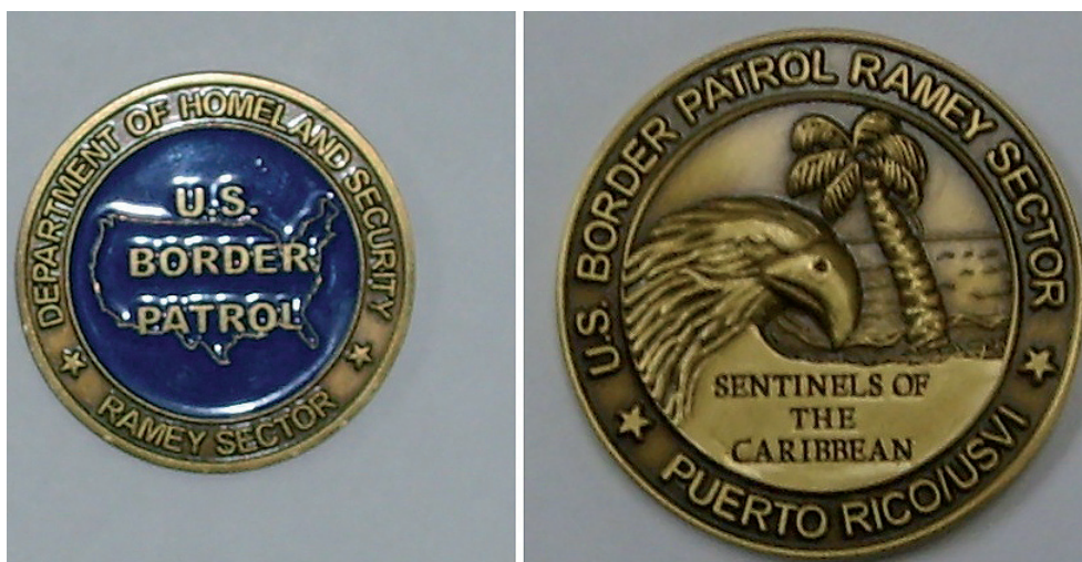
Figure 4: Challenge Coins RAMEY sector US Border Control. Qué sorpresa desagradable!! (What a disagreeable surprise!)