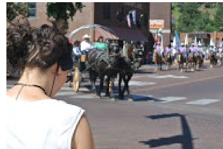
I use Dimensional Stereo Microphones (DSM) by Sonic Studios to record the Days of '76 parade as it winds its way down Deadwood’s Main Street. The annual event started in 1924 as a way to attract newly mobile tourists to Deadwood. Today, it is still an important celebration of local heritage. Photo by Ali Pitt, July 2014