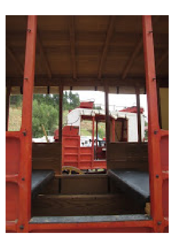
The Deadwood Stagecoach prepares for the Days of '76 Parade, a historic part of Deadwood's annual Days of '76 rodeo. The stagecoach is normally housed in the Days of '76 Museum, owned and operated by Deadwood History, Inc. Photo by author, July 2013

In this experiment, one of the primary goals is to respond to a methodological approach common to heritage producers, the desire to document and understand other lifeworlds through sensory experience. In South Dakota, this approach is foundational to the state's tourist economy and to its forms of exploiting and colonizing local Lakota peoples. But, rather than question only the content of these productions, I aim to challenge the basic assumption that sensing equals knowing. This is a response to the function of sensory knowledge in the state's tourist infrastructure, where "knowing" is the result of a mythic frontier journey. In this journey, encounters with "Native South Dakota" do not produce knowledge of local Lakota peoples, but act as media of transformation for non-native tourists to acquire self-understanding in the form of heritage experiences. This is basic frontier mythology, but it is also materialized in how museum exhibits and heritage performances are made in the region. And, it accounts for a sentiment that recurred throughout my fieldwork with local Lakota performers and producers – the feeling that no matter how much tourists listened, they could never hear.