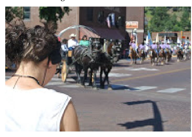
I use Dimensional Stereo Microphones (DSM) by Sonic Studios to record the Days of '76 parade as it winds its way down Deadwood's Main Street. The annual event started in 1924 as a way to attract newly mobile tourists to Deadwood. Today, it is still an important celebration of local heritage. Photo by Ali Pitt, July 2014