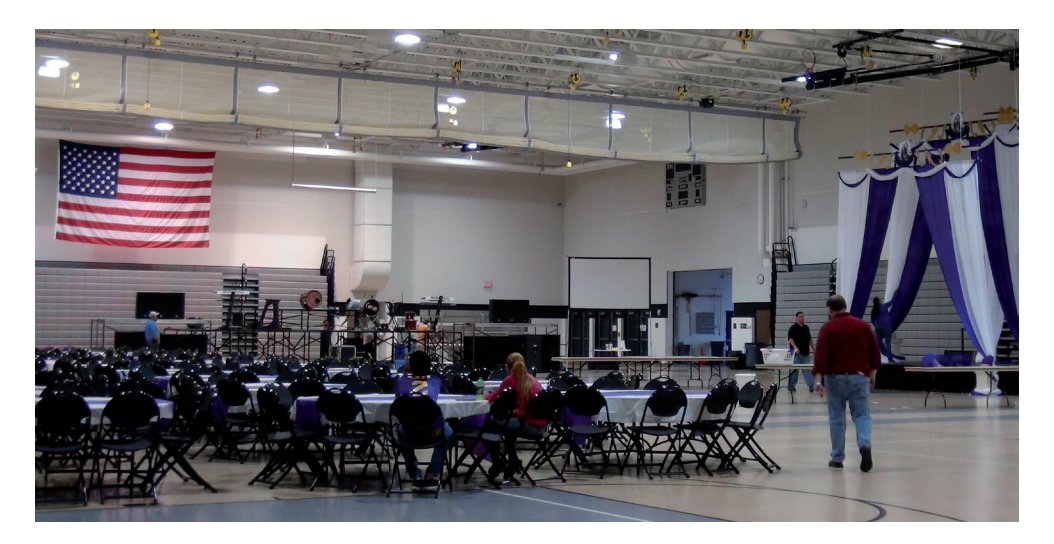
Preparing the multi-purpose hall the day before the feast, Fort Pierce 2013

The multi-purpose hall was quite big (for a family feast), 50 tables with 10 chairs each had been decorated in violet and white (the colours of the Lenten Season) with the produced decorations. At one side long curtains were hanging from the ceiling to frame Jesús Nazareno adequately. As the statue is very small, it was important to mark where it was standing. On another side a huge stillage was put up for the live music which was to play later in the evening and a second one for playback music which played full blast all the time. Behind the music equipment tables were set up to serve the food. And above all a huge American flag was hanging, reminding everyone where they were.