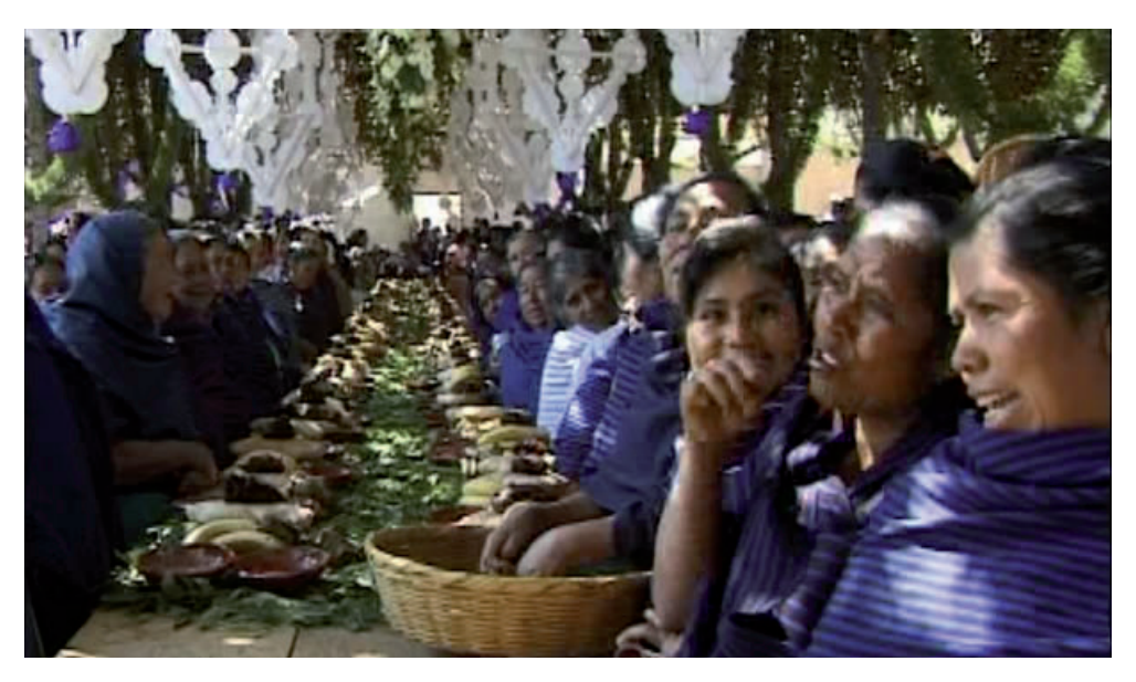
La\ mesa at the feast for Jesús Nazareno grande, Patamban 1998

After having served the meal it was time for a special custom: la mesa . The feast commemorates the Last Supper of Jesus. Therefore, in the home village special food is offered to the whole village.