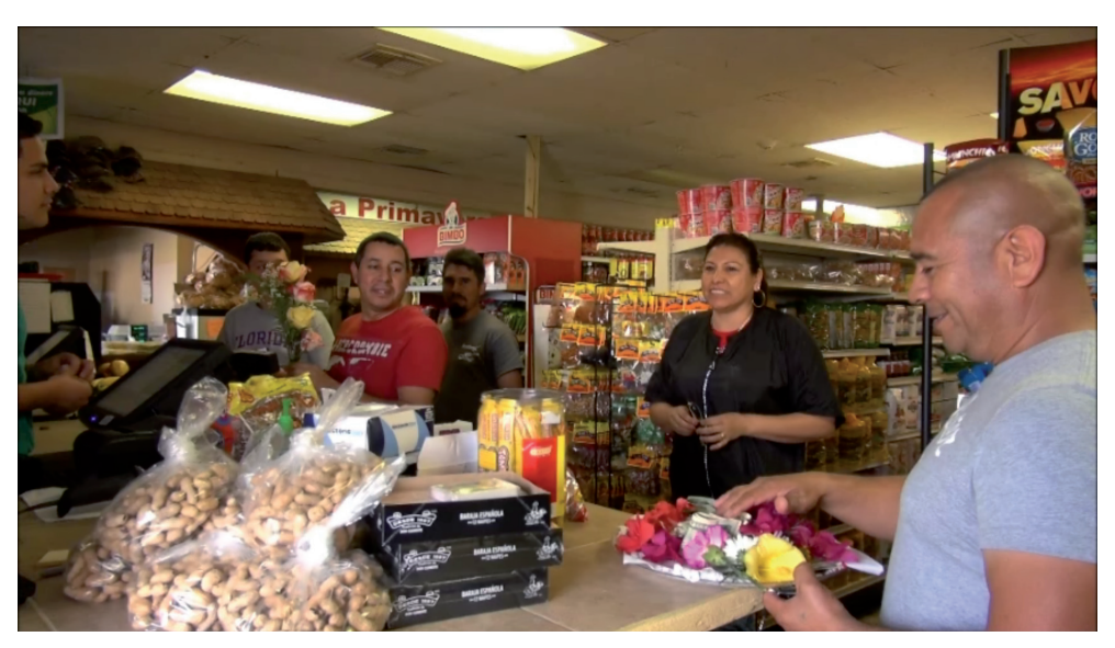
Asking for a contribution in a Mexican grocery shop, Fort Pierce 2013

In one case, a shop owner who is very attached to Jesús Nazareno, introduced this group to other Mexican shop owners nearby, inviting them also to the feast and asking for a contribution. Everybody can come to the feast; everybody can invite anybody else to come to the feast. In this way, the community around Jesús Nazareno is growing continuously and becoming constantly more diverse.