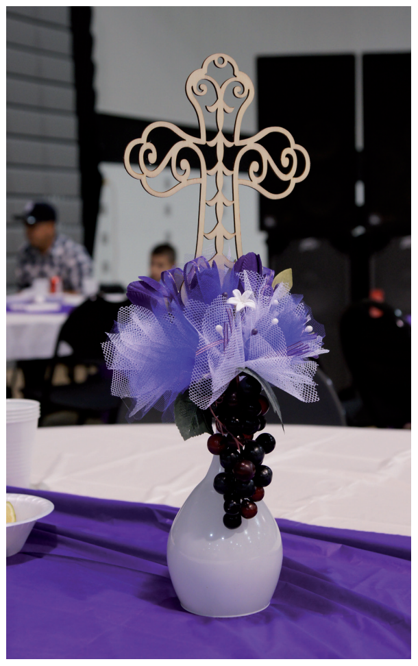
The table decoration at the feast for Jesús Nazareno, Fort Pierce 2013

An event like the feast for Jesús Nazareno is no longer a local event only; it is spreading out and gaining translocal and transnational relevance. And it is no longer a momentary event. Lasting memorabilia are produced and kept for a long time. The decorations on the tables were made to remember the event.