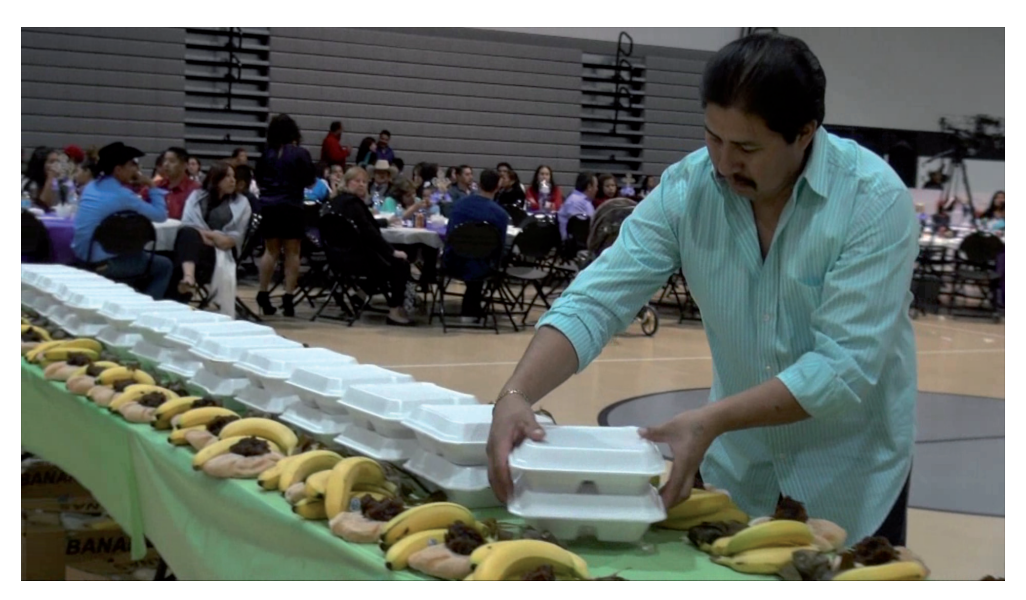
Preparing la\ mesa at the feast for Jesús Nazareno, Fort Pierce 2013

After the mesa and the rearrangement of the multi-purpose hall the viejitos danced. La danza de los viejitos (the dance of the old men) is widespread in Michoacán and thus addresses many of the migrants. The dancers are dressed in Purhépecha costumes, i.e. represent the indigenous population of Michoacán, and they dance like old men. It is danced on several occasions, but in the home village certainly not during Lenten season. In Florida the migrants have decided to integrate the dance in the feast for Jesús Nazareno as there are not many occasions to perform it. Some weeks before the feast men and children begin to meet in the afternoon or evening to practice the dance.