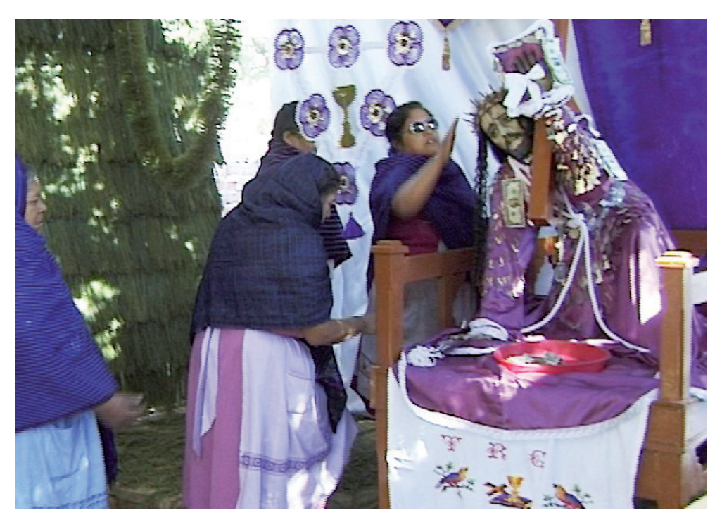
Veneration of Jesús Nazareno grande, Patamban 1998

Jesús Nazareno is held in cargo , i.e. families can ask the owner to host the statue for one year. They are obliged to give daily access to believers who want to visit him. They have to illuminate him and to participate in all the events for which Jesús Nazareno is requested. Quite often believers solicit a special mass for him for various reasons. The statue has to be brought then to the church or even into another private home for the celebration. The carquero (commissioner) is obliged to accompany Jesús Nazareno wherever he goes. The summit of the cargo is the feast for Jesús itself. The feast is organised by the carguero but as it is such a miraculous image the whole village somehow takes part. Besides the helpers coming from the carguero's social network, many people contribute voluntarily by bringing little or bigger gifts, helping in the preparations, taking over certain tasks such as the fabrication of adornments, etc. On the day of the feast a mass is read at the carguero's house and hundreds of visitors come, paying a contribution and receiving bread, bananas, conserva (a sweet dish of calabash) and a small meal. The food is served on a very long table.