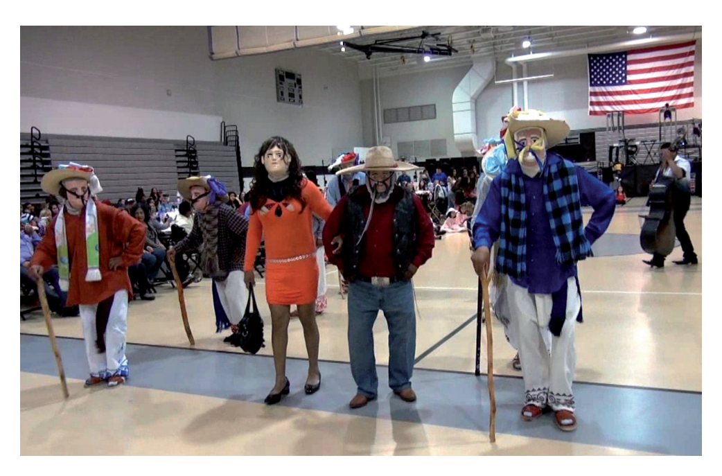
The dancers performing the dance of the viejitos at the feast, Fort Pierce 2013

At the feast, first the men danced and after a while they integrated the car-gueros in their performance. Much more time was given afterwards to the children. They performed the traditional dance with enthusiasm and at the end were throwing candies into the audience. Even people from other places were attracted and could identify themselves with the dance. Thus the dance being a cultural marker in Michoacán is becoming one in Florida also, but somehow in a different way.