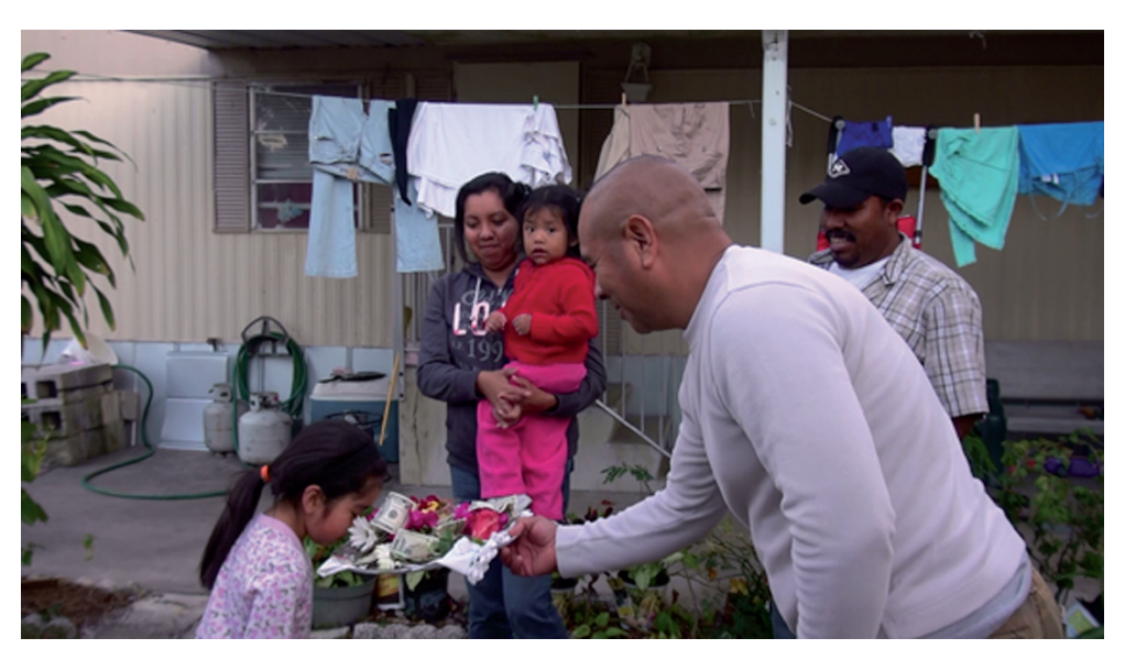
Kissing the crown of Jesús Nazareno, Fort Pierce 2013

The carqueros are responsible for the organisation and they need many people to help them, to prepare and manage the feast, and they need people to attend the feast. Therefore, the carguero and his wife were running around for weeks to invite helpers and guests to the feast. They travelled far, visiting people two to three hours away, mainly migrants from the home village and their families. On one weekend, the carquero together with men of the core group drove around the town, up and down, and invited people to the feast while also asking for a financial contribution. They took with them a plate covered with a table napkin with the crown of thorns of Jesús Nazareno on top adorned with some flowers and a tambour. In the home village young relatives of the carquero walked through the village for several days knocking on all the doors. In both places they reminded the villagers respectively migrants of the feast and asked for contributions. In Florida, when touring the town, they also invited neighbours who happened to be there, they invited people from different origins which had attended the feast before, and they invited people they happened to meet that day. In most cases, a member of the family they visited brought some money to give to Jesús Nazareno; they and their children kissed the crown and they started chatting with each other.