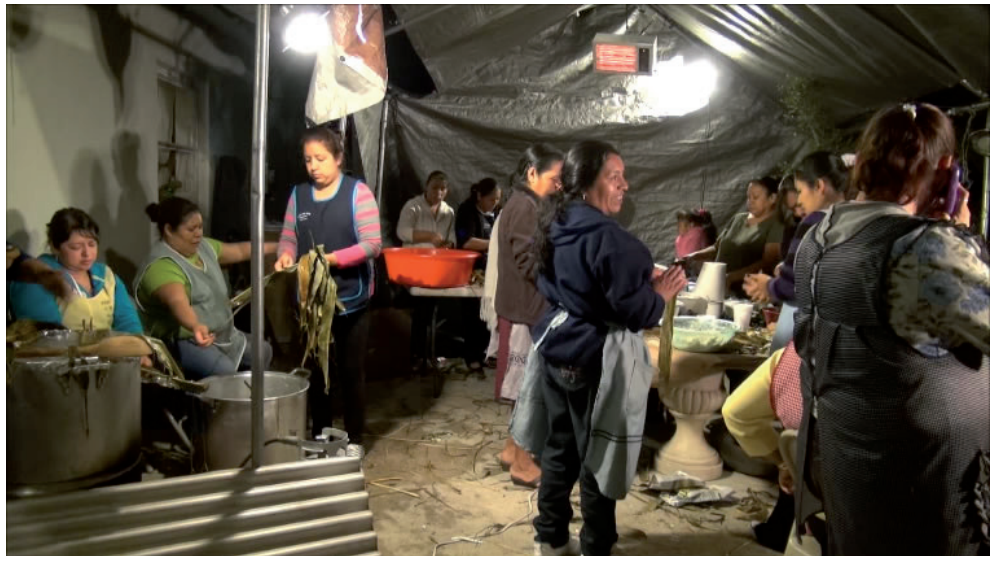
Women helping in the night before the feast, Fort Pierce 2013

500 participants were expected to come to the feast. For this occasion three cows were given to the carguero and slaughtered by him and relatives and friends. One member of the core group cooked most of the meat at his private home over night and brought it to the multi-purpose hall in due time. The day before the feast several women met in the house of the carguero to prepare special food for the mesa (table, see below). The preparation of the food took the whole day – in the home village it takes more than a week – and everybody can participate.