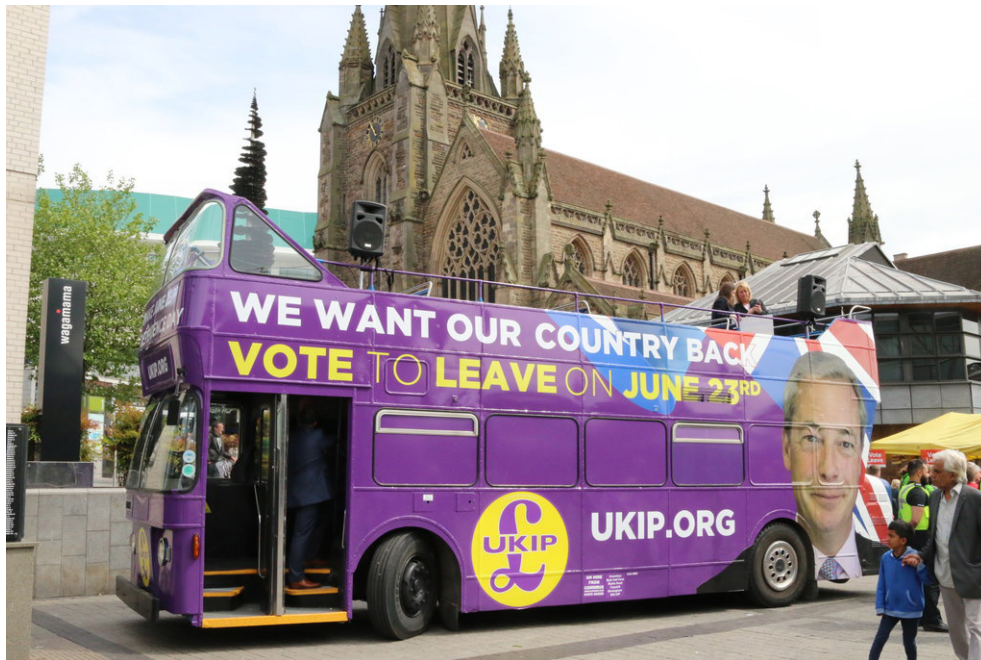
Fig. 5. 'Nigel Farage's battle bus in Birmingham on the pre-referendum tour', May 2016.