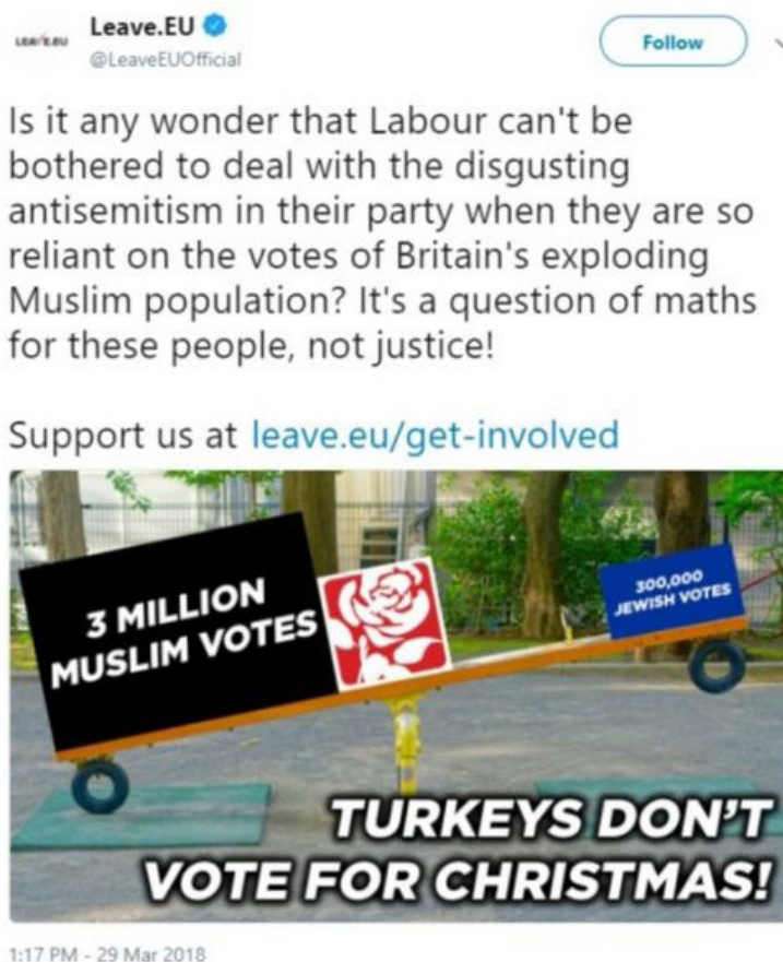
Fig. 4. LEAVE.EU message published on Twitter on 29 March 2018.

As already noted, Banks launched a photograph of Grenfell Tower at the height of the fire (which the Daily Mirror bravely re-published) with the following words superimposed: 'An amnesty for Grenfell illegal immigrants? Absolutely not! The law is the law' (see Figure 3). Banks's image could well have been the inspiration for an unimaginably and darkly violent ritual incarnation carried out in south London of the myth theme he had constructed. In November 2018 (around the time of Bonfire Night), party goers built and then burned a model of the Grenfell Tower, with brown faces at the windows. Video pictures reproduced in newspapers the following day a group of white party goers lifting the tower into a bonfire and laughing as it and the models inside went up in flames. A George Cross flag appeared in the background. A cheer goes up as the model finally falls, burnt out, to the ground. A cosmopolitan home is reduced to cinders. One cannot help but be reminded of the initial target of those who surrounded Sarajevo at the start of the war in Bosnia-Herzegovina, namely the Sarajevo Library, also the home and standard bearer of cosmopolitan history and heritage.