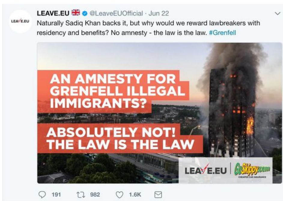
Fig. 3. LEAVE.EU message published on Twitter on 22 June 2017, days after the Grenfell fire.

roost. Thus, thirdly, when the multi-cultural inhabitants of the former empire began to ‘come home’, the sense of resentment grew. Islamophobia and racist dispositions towards Eastern Europeans and others grew. These found their way into anti-European Union rhetoric and the idea not only that the EU was responsible for ‘illegal immigration’ but that the UK had no power to stop this. This sense of powerlessness has been inflamed by the buffoonery of ‘vassal state’ utterances by Johnson, Jacob Rees-Mogg, Farage and other leading ‘bastards’ or ‘bad boys’ 15 that, as Lammy (2018) has rightly said, conjure sightings of a darkening horizon beneath which lurk the malignant shadows of Tommy Robinson and his fascist thugs. An example of this came to light in 2017, following the Grenfell fire. The largest single donor to the Vote Leave movement, Arron Banks, launched a photograph of Grenfell Tower on the LEAVE.EU Twitter account (see Figure 3). Across the picture was the text ‘An amnesty for Grenfell illegal immigrants? Absolutely not! The law is the law’. Next to the group’s logo was another one, of Banks’s GoSkippy.com insurance company. The Daily Mirror re-published Banks’s image in a double page spread excoriating its author and his associates. We return to the image in part III.