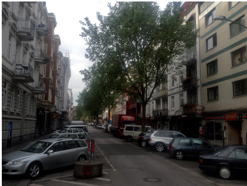
Figure 2: Hamburger Berg, view from Simon von Utrecht Straße. A seemingly quiet street by day, a very different sight at night.

J: I moved here ten years ago because I wanted to [her emphasis]. Because I thought it's the most... It's the neighbourhood with the most subcultures, where you can be a bit more punky or where things are a little more relaxed. It's a really villagey feeling here or this is the... how you say? The reputation it has. Of course, things have changed here a lot. Like my grandfather, my great-grandfather and my father they also grew up here in St. Pauli and what they tell about this neighbourhood is completely different from what it is now. So... but it still has this reputation of being different, being a bit more with the people and this is the idea I like. And of course, most of my friends live here too. But of course, I don't mind dirt for example or people using drugs or something. I grew up with it, I grew up in Billstedt, I don't know if you know it. So I don't mind, because I'm used to that thing... but I think also that this brand of St. Pauli is used too often. I think people see more in it than it is actually. For me it's like an empty shell that is now pumped up like St. Pauli is so great, but it's [sic] nothing in it because... yeah, all the old stuff that made St. Pauli famous is not there anymore, it's just commercialised. [...] People, I think, take it a bit too seriously, this authentic St. Pauli thing. Like they think... They have so many ideas behind this St. Pauli bubble. So for me it's empty and people try to defend it what is not there.