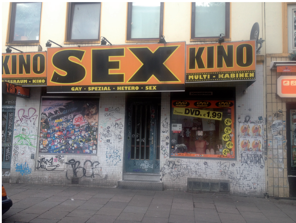
Figure 3: Sex cinema and shop on Hamburger Berg

Some of his favourite spots in the quarter are Café May, Park Fiction and a friend's garden, which, to him, is the perfect St. Pauli spot for coffee in the sun. He is nostalgic about the former glory of the Reeperbahn, with places such as Café Käse, now replaced by a fish sandwich shop, and the emergence of a lot of fancy, touristy, expensive businesses. He also remembers a time when the doors in his building were often open and neighbours were close to one another. Now, he knows a few people and the relationships are rather formal.