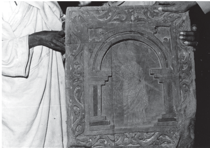
Fig. 1: St. George. Painting. Bēta Gabre'el at Lālibalā, Lāstā.