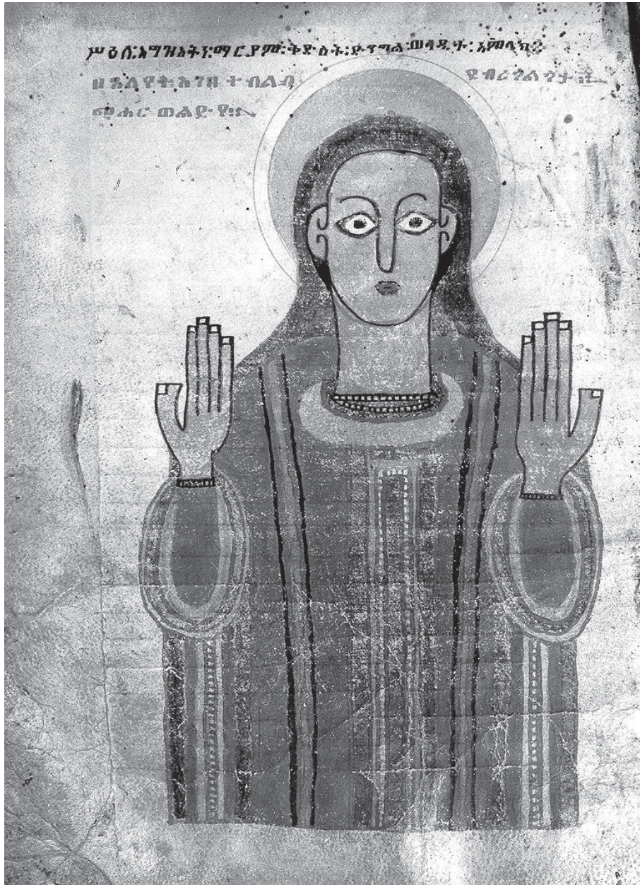
Fig. 4: Virgin Mary praying. Book of Psalms. Miniature. Private owner. Ambässal, Wallo.