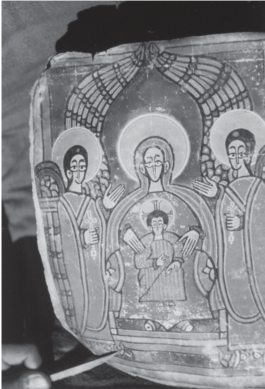
Fig. 6: The Enthroned Virgin with the Child on her lap . Miniature. Dabra Warq, Goğgām