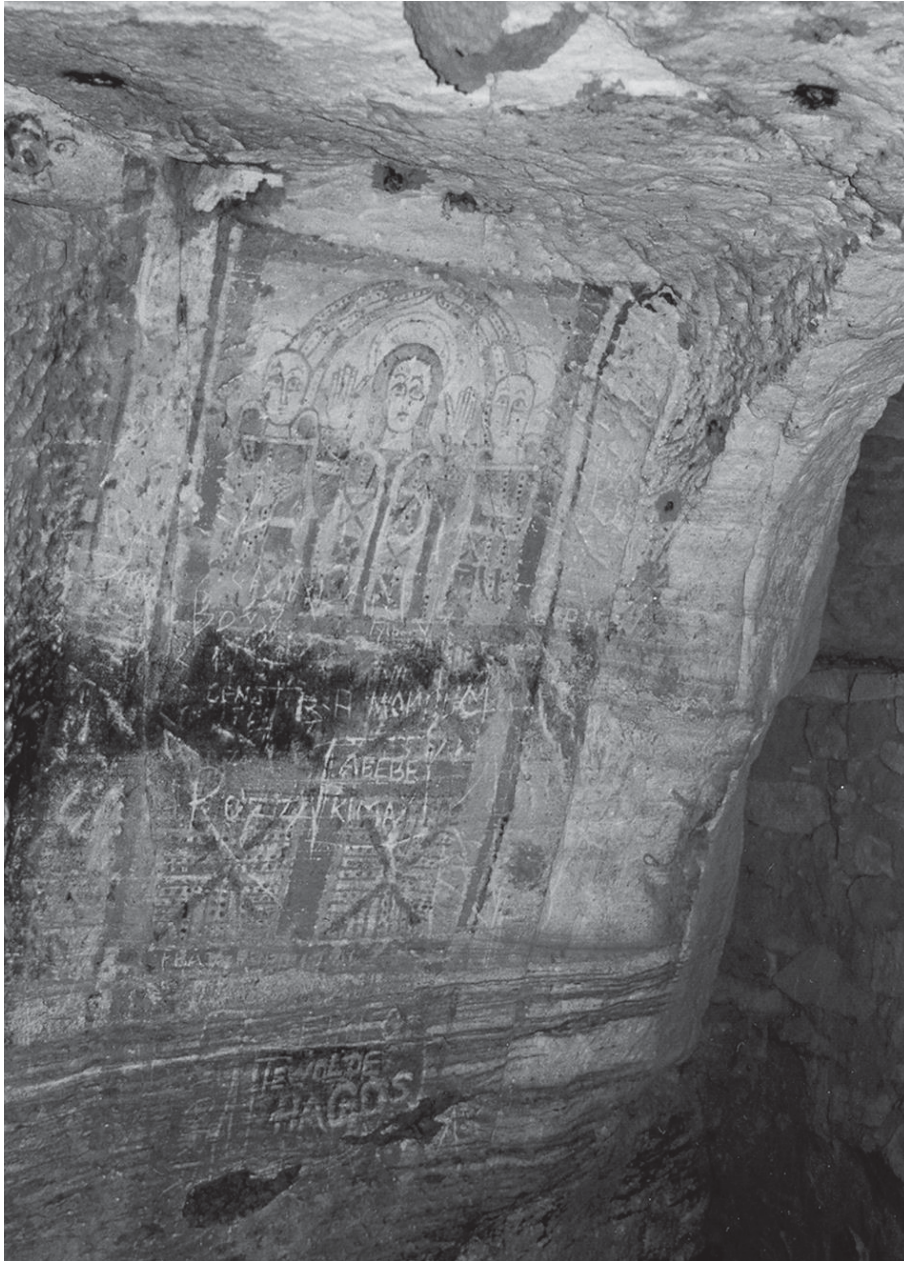
Fig. 5: Orant Virgin Mary with two Archangels . Wall painting. Waša Sāmu'el, Tambēn.