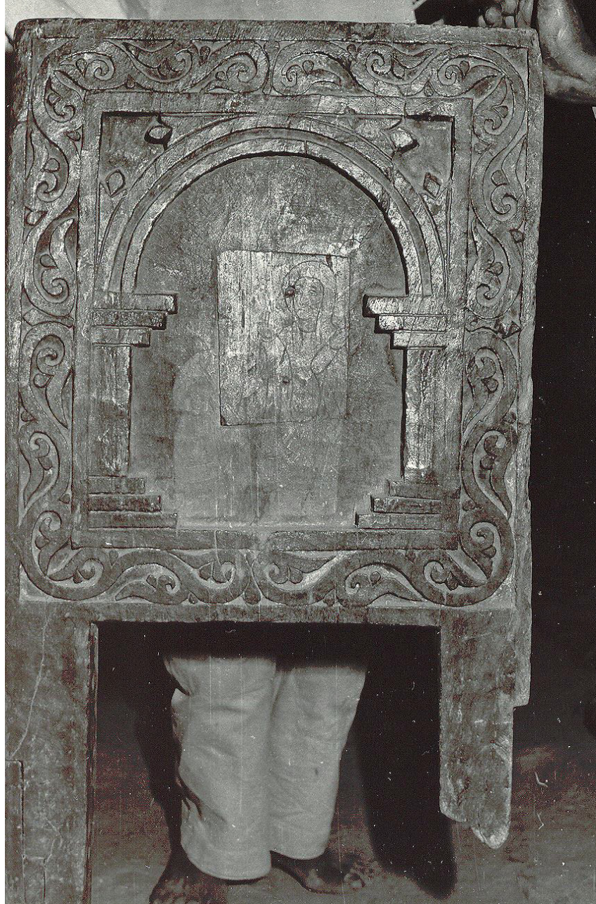
Fig. 2: Virgin Mary (?). Painting. Bēta Gabre'ēl at Lālibalā.