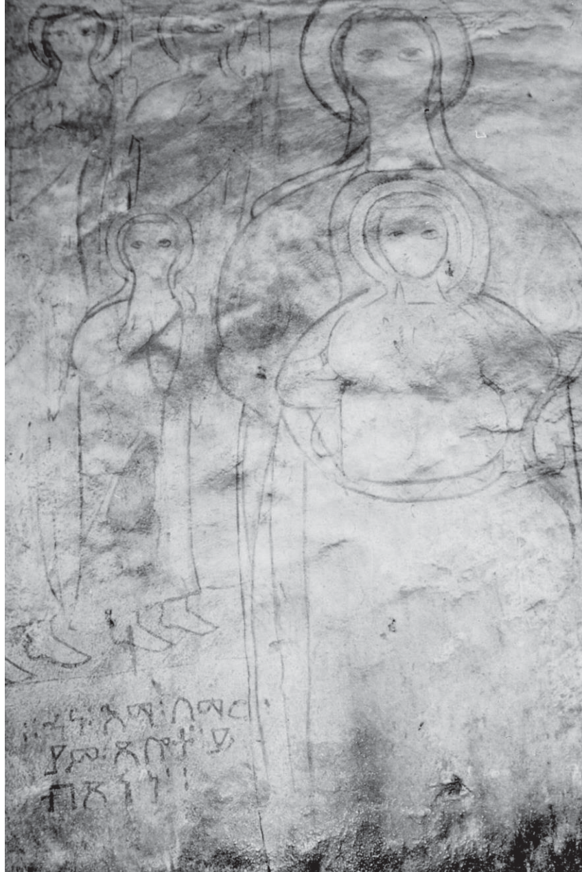
Fig. 3: St. Anne with Mary the Child. Wall painting. Gannata Māryām church, Lāstā.