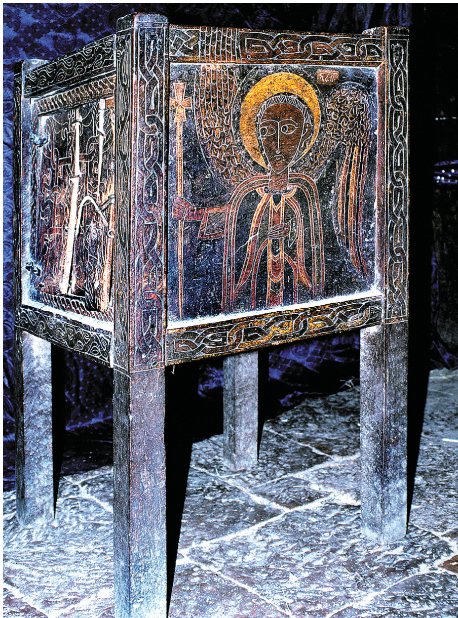
Fig. 9: Church of Betäləhem, Gayənt (Bägemdər). Portable wooden altar decorated with archangels and painted