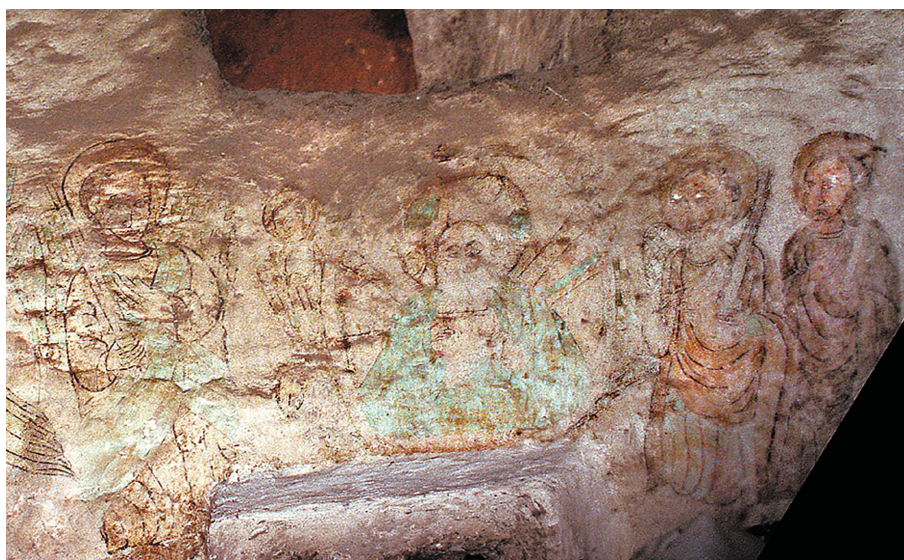
Fig. 3: Church of Gännätä Maryam (Lasta). Mural of the Maiestas Domini on the east wall of the SE pastophorion