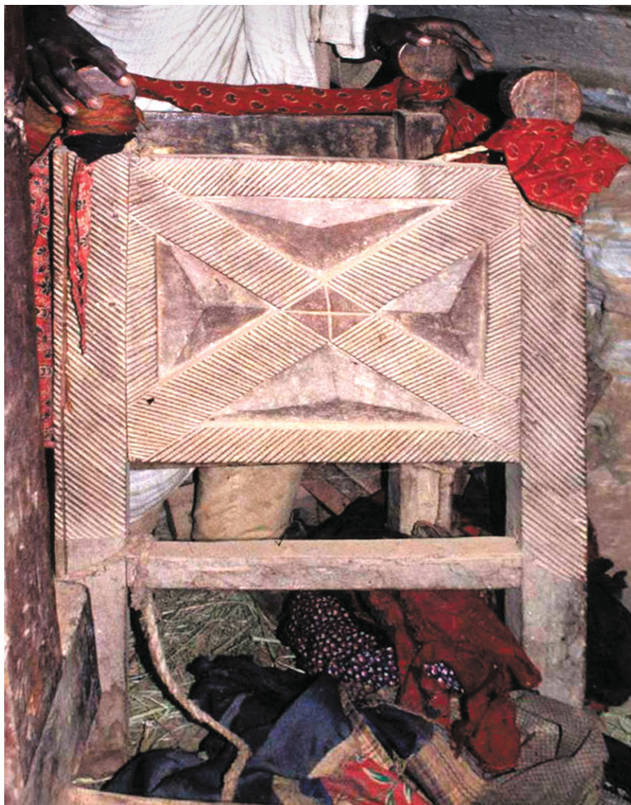
Fig. 7: Church of Qirqos Agobo (Təgray). Portable wooden altar with round corner units, in S pastophorion