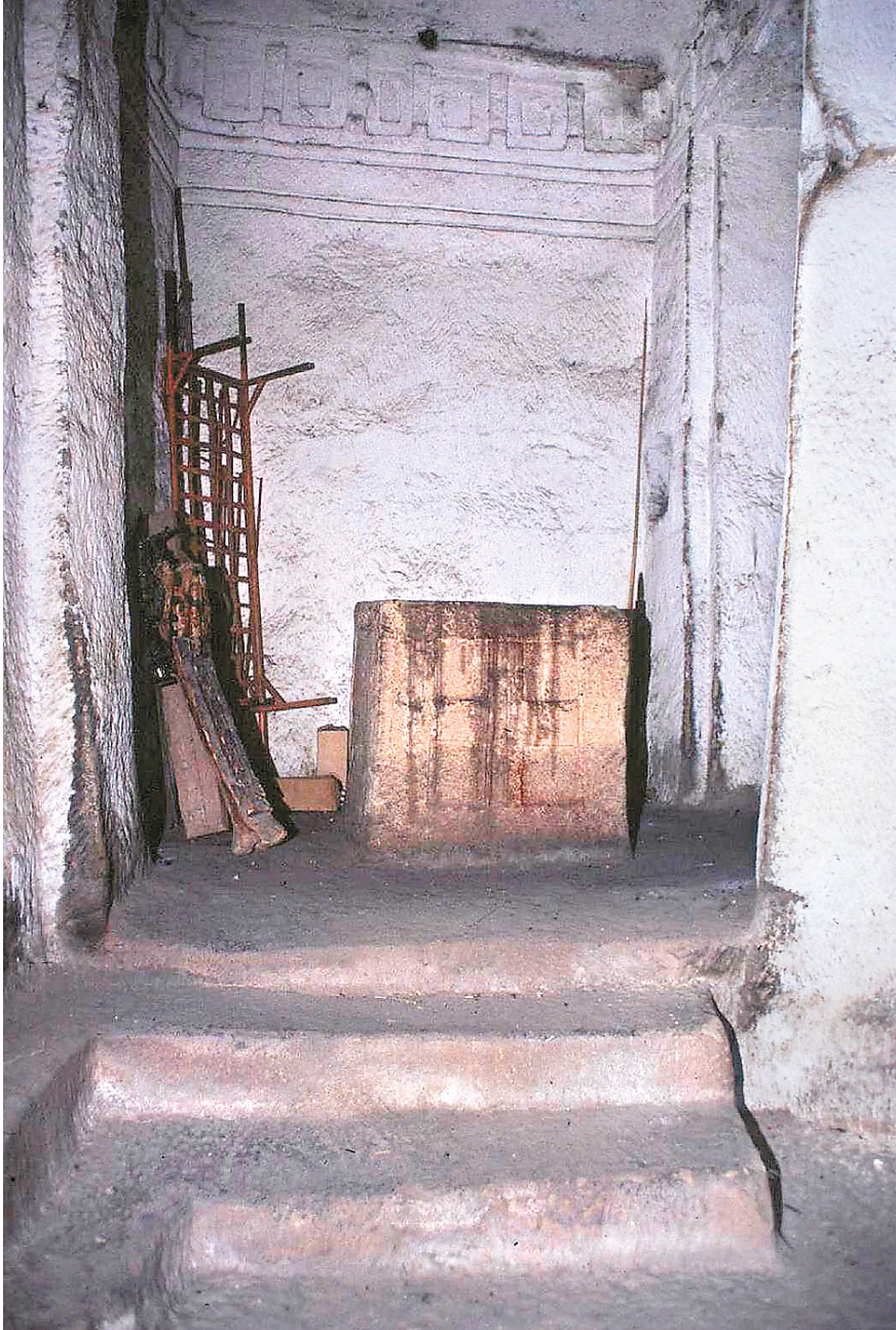
Fig. 5: Church of May Kado Giyorgis (Təgray). View of the monolithic cubic altar in the north, autonomous chapel or parekkesion