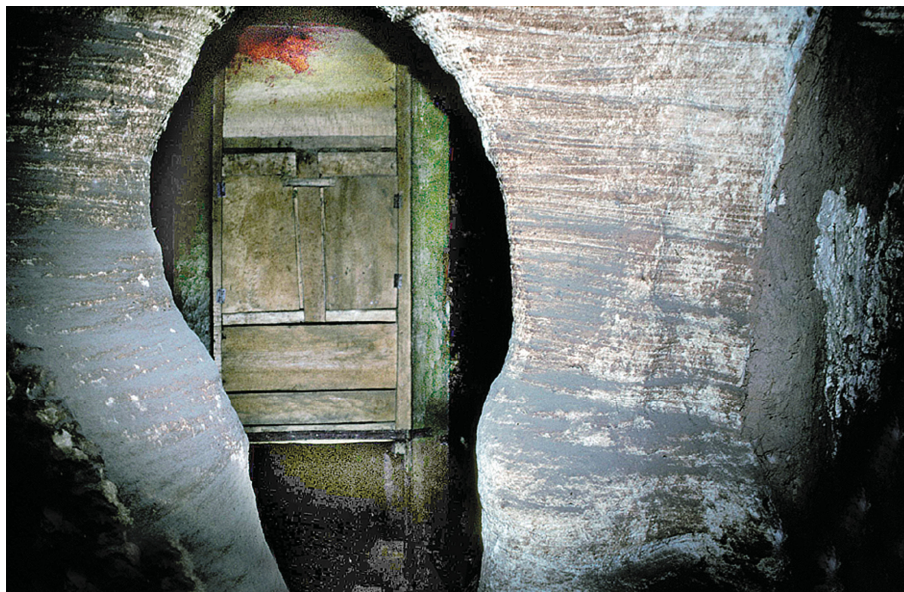
Fig. 2: Church of Gundäfru Śällase, Aşbidära (Təgray). View through widened arch from north pastophorion towards central altar