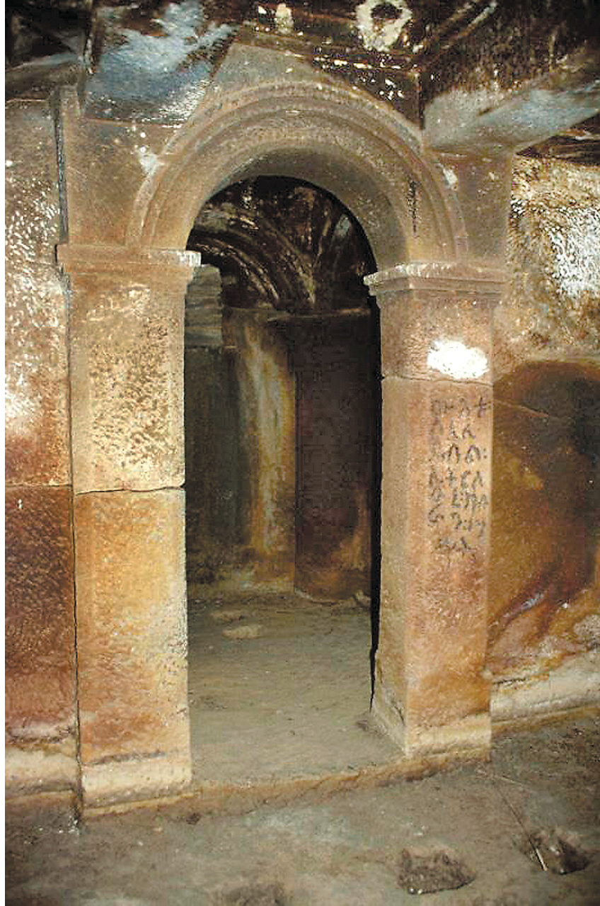
Fig. 6: Dəgum, north church, Gär°alta (Təgray). View through sanctuary arch showing post holes for supporting the altar and, in the foreground, the chancel screen