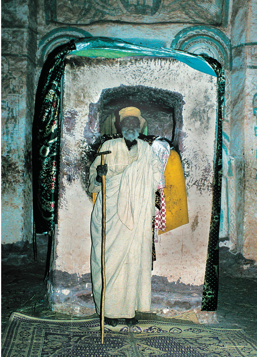
Fig. 19: Church of Däbrä Şəyon, Gära'alta (Təgray). Monolithic high-altar of ciborium type