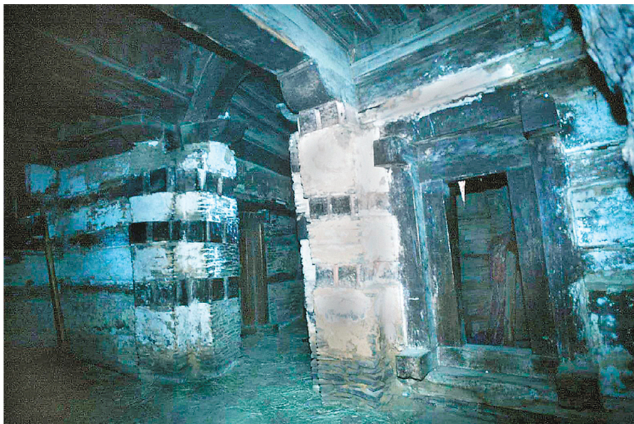
Fig. 12: Church of Qirqos Agobo (Təgray). View towards NE, showing sanctuary arch with doorway to N pastophorion and, on the right, doorway from S aisle to S pastophorion