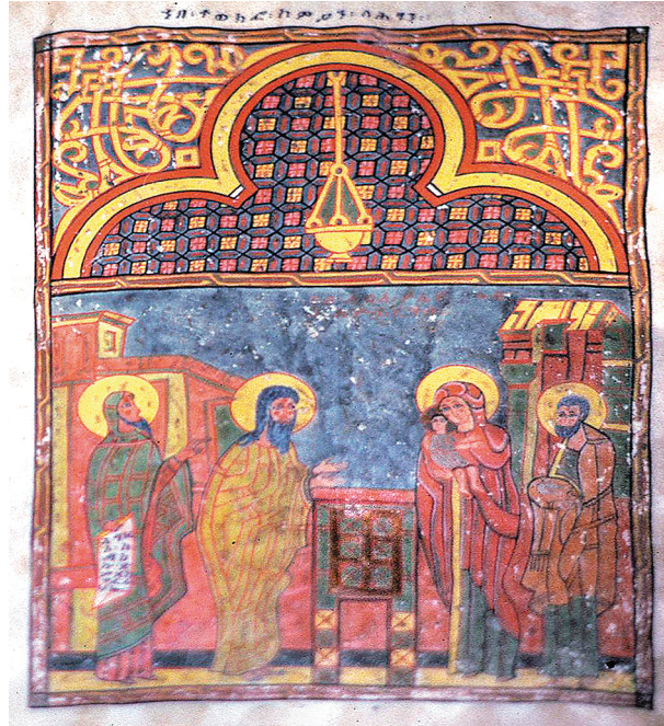
Fig. 10: Gospel book of Kəbran Gäbrä'el (Lake Ṭana). Presentation in the Temple, depicting a “portable” altar (fol. 13r)