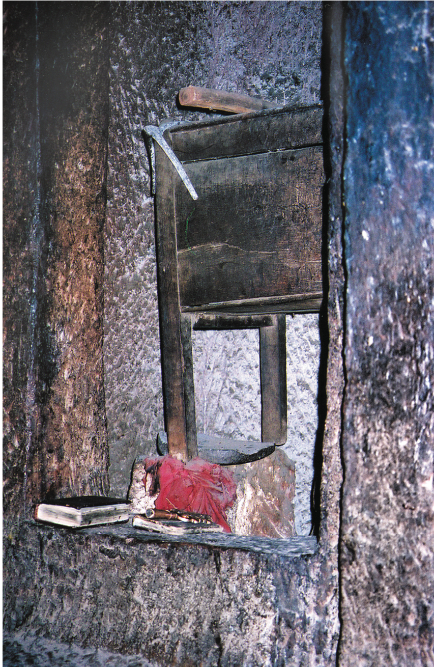
Fig. 1: Church of Bilbala Qirqos (Lasta). High-stepped entry to south pastophorion showing a wooden altar in secondary placement