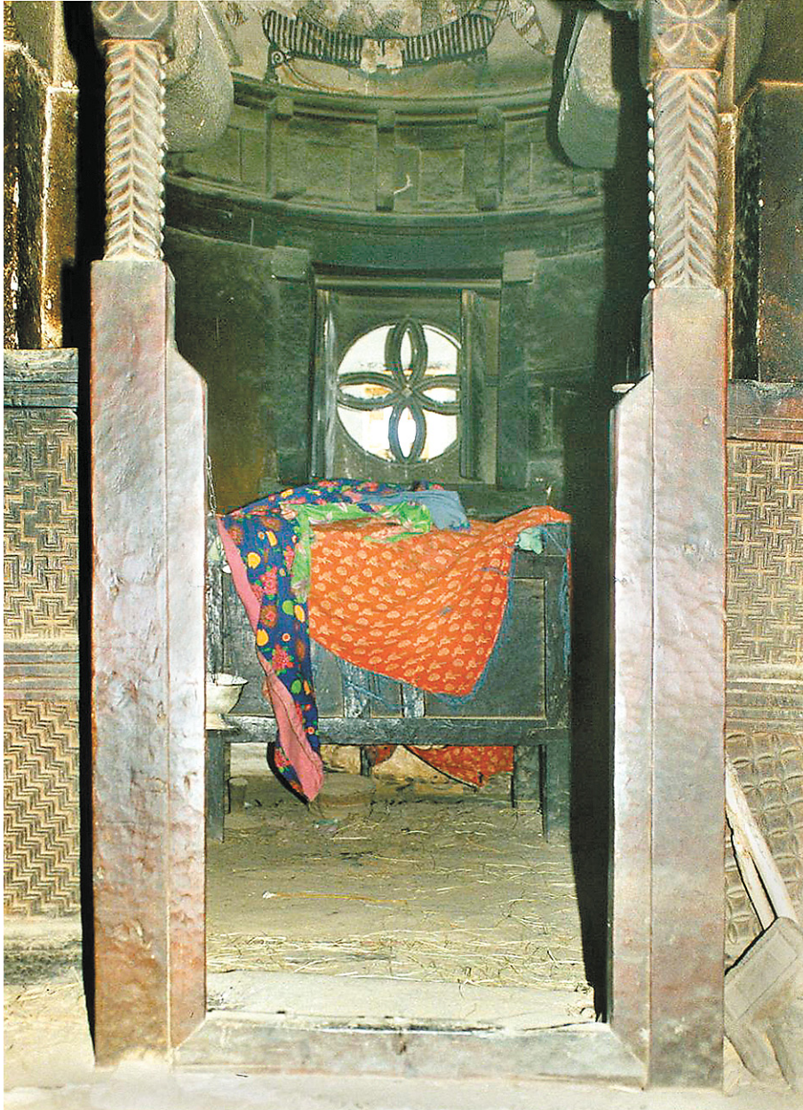
Fig. 8: Däbrä Sälam Mika'el, Aşbidära (Təgray). Heavy wooden "chest" altar with feet ensconced in rock floor