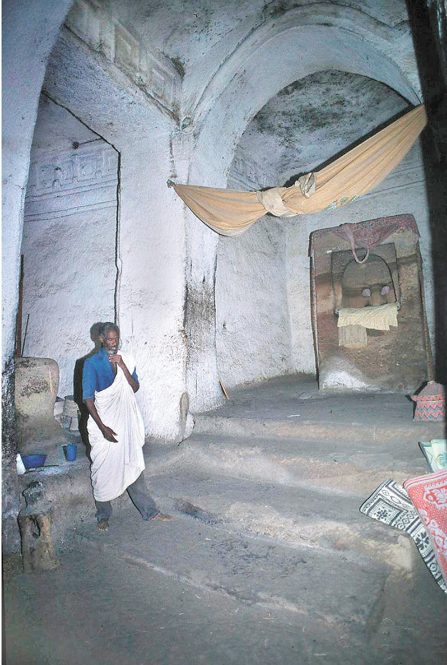
Fig. 4: Church of May Kado Giyorgis (Təgray). View of monolithic high-altar, with monolithic cubic altar in the parekklesion (behind the priest)