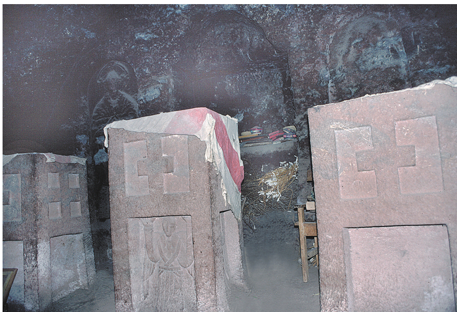
Fig. 13: Lalibāla, Šəllase Chapel (Lasta). Three monoliths fashioned after tall portable altars with chest and legs