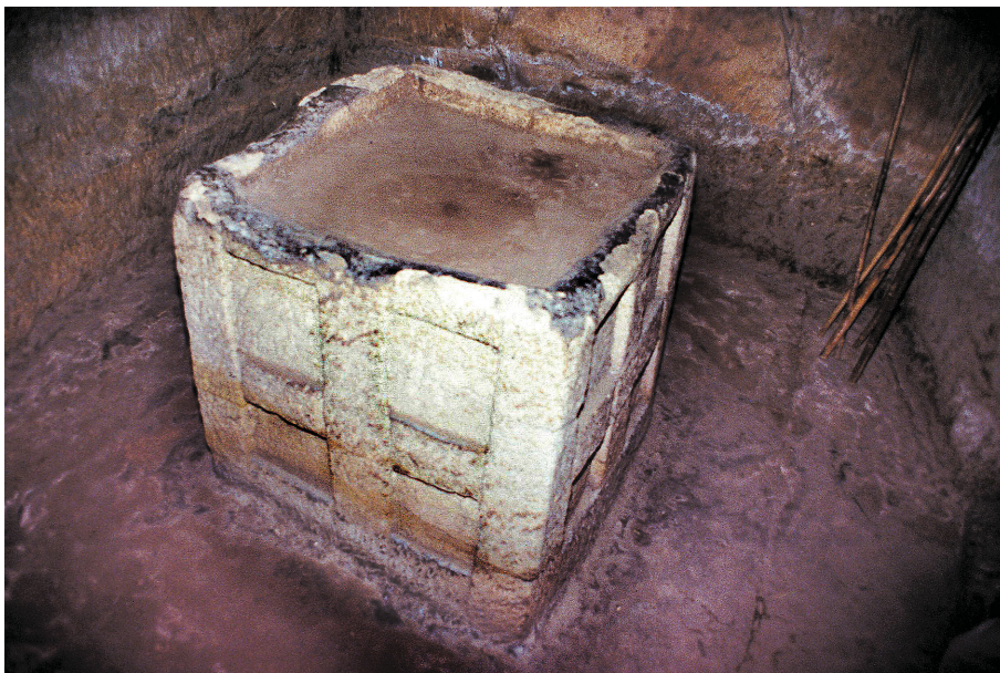
Fig. 17: Maryam Wəqro (Amba Śānnayti near Nābälät, Təgray). Monolithic cubic altar in NE sanctuary