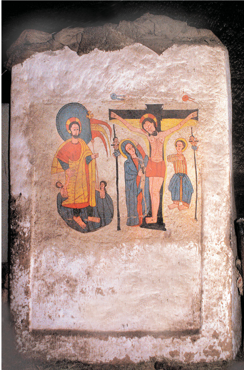
Fig. 15: Church of Abba Yoḥanni, Tämben (Təgray). Front view (west side) of the unfinished monolithic central altar