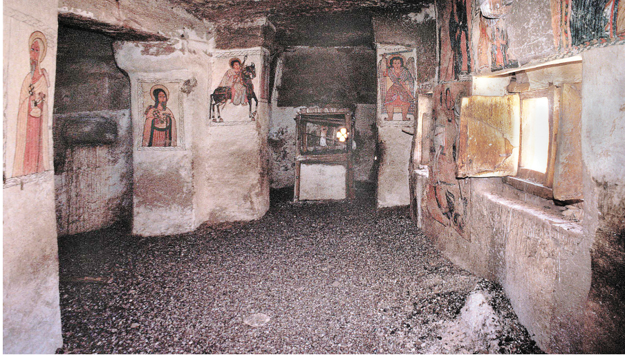
Fig. 16: Church of Maryam Dəngəlat, Haramat (Təgray). View towards sanctuary showing monolithic altar with wooden frame