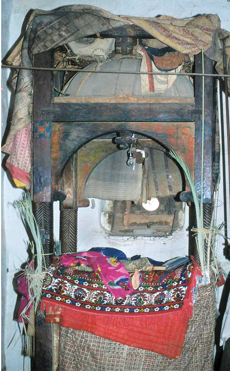
Fig. 20: Church of Däbrä Garzen at Gundä Gunde, °Agamä (Təgray). Ancient wooden high-altar surmounted by a framed cupola