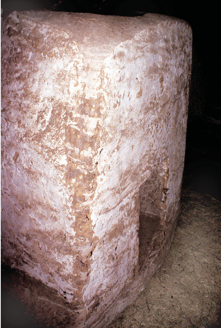
Fig. 18: Church of Abba Yoḥanni, Tämben (Təgray). Rear view (east side) of the unfinished monolithic central altar showing lower cavity