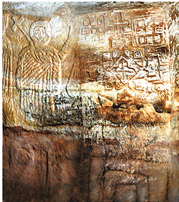
Fig. 11: Church of Däbrä Şəyon, Gär'alta (Təgray). Relief in prayer room of Abunä Abərəham showing priest incensing a monumental high altar