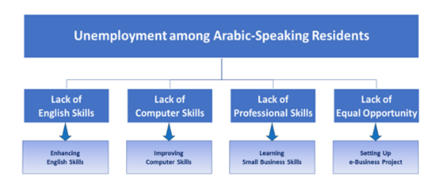
Figure 1: Educational Intervention: START Training Program

ent educational backgrounds and have different interests and professional skills concerning the e-business they inspire to set up. While the content of the training has a common basis, the learning activities are personalised for the trainees, as they depend on their prior knowledge, skills, and business interest, where each learner reflects on their needs and intentions for developing their e-business. However, when designing and developing an educational intervention, we also need a theory that can tie the design specifications and the practice of training with the research.